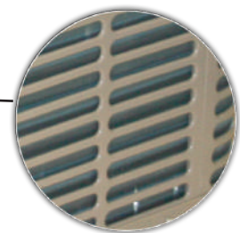
METAL CABINET GUARD