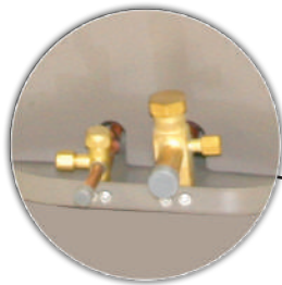
EASY ACCESS SERVICE VALVES